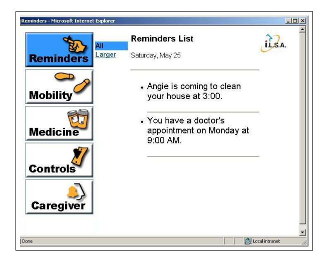
Figure 2: A sample webpage from the elder user interface.

Caregivers could access I.L.S.A. data about their client/family member with their normal ISP Web connection. The caregiver Web interface allowed the caregiver to view and acknowledge alerts, view general ADL status (including historical trends for medication and mobility, view and edit prescription and medication schedule, and set up