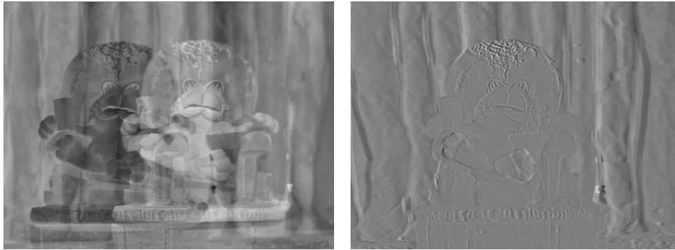
Figure 5. Gray level representations of disparities between the image pairs of Figure 3 (left above) and Figure 4 (right above). When corresponding pixels are identical this representation is midrange gray; negative (left-right) differences are darker, positive differences lighter.