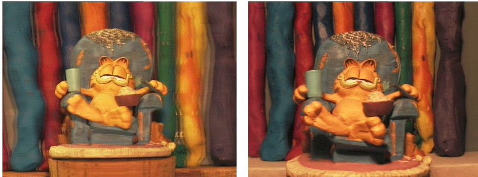
Figure 8. (left) Crosstalk perceived as "ghosting" illustrated by averaging the two views in Figure 4. (right) Crosstalk perceived as "blurring" illustrated by averaging the two views in Figure 6. Most viewers find ghosting objectionable, but consider blurring a normal phenomena.

As illustrated below by Figure 8, with microstereopsis, crosstalk is perceived not as ghosting but as blur, and in fact, as a normally acceptable kind of blur, the blur associated with the lens's finite depth-of-focus. This suggests that microstereoscopic imagery could be displayed on hardware that permits more crosstalk than is acceptable with conventional stereoscopic imagery. This idea has been tested by viewing temporally-multiplexed conventional and microstereoscopic imagery through LCD shutter hardware that was modified to allow controllable degradation of its on/off transmission ratio. Although to date the experiment has been conducted only informally with a few colleagues as subjects, the hypothesis appears to be correct.