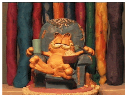
Figure 2. Motion parallax (“depth-from-motion”) illustrated by an animated GIF file that can be viewed at http://www.cs.cmu.edu/afs/cs/user/mws/ftp/spie99/Figure_2.gif .

By far the most important depth cues in the real live word, after binocular stereopsis, are the “motion parallax” cues related to the relative motion and the internal dynamics of the objects in the scene, plus the motion of the viewer (or camera) with respect to the scene. In the artificial worlds of cinema and video, excepting only the relatively few 3D-stereoscopic productions that