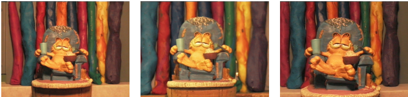
Figure 1. Pictures of the same scene with telephoto (left), normal (middle), and wide-angle (right) lenses at corresponding long, intermediate, and short distances from camera to scene. Notice “flatness” at left, “depth” at right.

A phenomena that is not mentioned explicitly in the literature that we have encountered but that we would include from our own observations is perspective distortion , the distortion of the relative size of closer and farther objects (and parts of objects) when the scene is captured from a longer distance by a longer focal length lens vs. from a shorter distance by a shorter focal length lens. [Valyus (Section 2.1.5) and Schwartz (Section 2.1.6) both mention the contribution of “perspective” to depth perception, but it is unclear whether they are referring specifically to perspective distortion or rather to the better known (and apparently different) perception of, e.g., parallel lines appearing to meet at the horizon.] Perspective distortion is illustrated in Figure 1, showing a scene photographed by telephoto, normal, and wide angle lenses at different camera-to-subject distances;