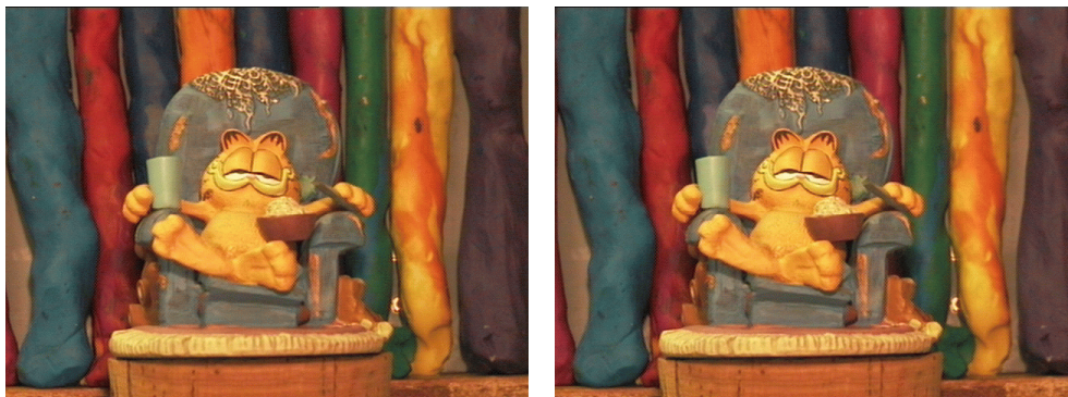
Figure 4. Left/right stereo pair, 1 m camera-to-subject, 50 mm lens, parallel axes, 40 mm interocular separation, center-of-interest compensated. In contrast to Figure 3, this pair can be fused only with difficulty on-page, but very comfortably on a CRT, or projected on a screen.