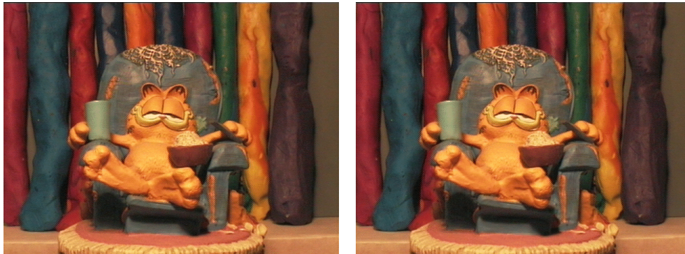
Figure 6. Microstereopsis illustrated by interocular separation ~3% of normal. The effect is visible with the telephoto lens used in the previous figures, but is enhanced here by also using a 12.5 mm wide angle lens and a correspondingly closer camera-to-subject distance.

Figure 6 and Figure 7 illustrate the effect of using a very small interocular separation, only a few percent of the normal 65 mm human interocular separation. Depth perception is enhanced by using a wide angle lens and taking advantage of the resulting perspective distortion, but binocular stereopsis is also adequately stimulated when the pictures are taken with telephoto lenses. Figure 6 can be free viewed reasonably comfortably, and the pair is very easy to view multiplexed on a CRT or a screen. The gray level Figure 7 shows how small the left/right disparity is, even in comparison to the already small disparity in Figure 4