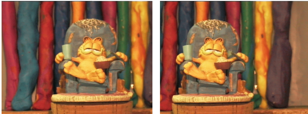
Figure 3. Left/right stereo pair, 1 m camera-to-scene, 50 mm lens, parallel axes, 40 mm interocular separation. Can be comfortably fused by “free viewing” with 65 mm on-page interocular separation, but disparities are uncomfortably large on a CRT or a distant screen.

Figure 3, Figure 4, and Figure 5 illustrate the effectiveness of “center-of-interest correction” in reducing the difficulty of viewing this scene stereoscopically. Figure 3 and Figure 4 are stereo pairs taken under conditions that were held as identical as possible; the only difference is that in Figure 4 the images have been shifted left/right to bring corresponding points in the vicinity of the center-of-interest into coincidence. These pairs can be viewed stereoscopically by “free viewing”. It should be apparent that the exact circumstances that make it somewhat easier to free view Figure 3 than Figure 4 (Figure 3 is viewed with the eyes converged, Figure 4 with the eyes parallel) make it substantially harder to view Figure 3 than Figure 4 when these images are viewed overlaid (e.g., temporally multiplexed) at the greater distance of a workstation CRT or projected onto a distant screen. Figure 5 provides gray level representations of the disparities in Figure 3 and Figure 4.