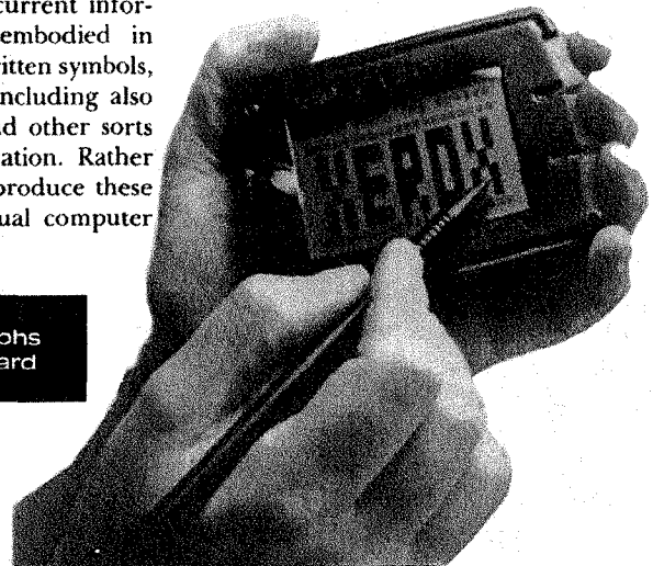
Figure 1. Photographs of Tab, Pad and Board

This then is Phase I of ubiquitous computing: to construct, deploy, and