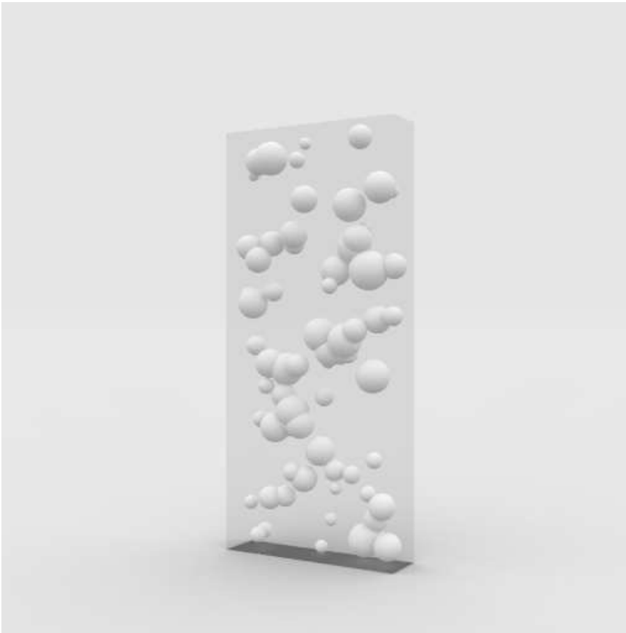
Figure 12: A strange object

In the year 2xxx, an expedition team landing on a planet found strange objects made by an ancient species living on that planet. They are transparent boxes containing opaque solid spheres (Figure 12). There are also many lithographs which seem to contain positions and radiuses of spheres.