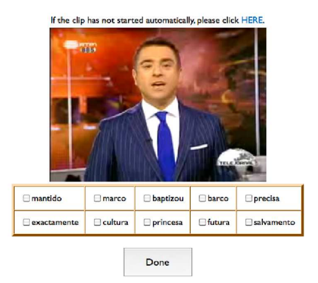
Figure 1: Tick interface of the vocabulary perception game.

initions are taken from the Infopédia<sup>2</sup>. A set of filters selects the definitions: (1) definitions containing cognates of the target word are discarded, since they are an obvious cue to the student; (2) only definitions of more than one word (to avoid similarities with synonyms' exercises) and less than 150 words (to avoid very long definitions) are considered; (3) characters that hinder the understanding of a given definition are removed (e.g. numbering of definitions, semicolon, cardinal, etc.); (4) the learning level of the words in the definition must be equal to or less than the level of the exercise and that of the target word it corresponds to (Lopes et al., 2010).