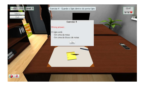
Figure 2: Screen shot of the 3D pictorial game. The player is asked to complete actions involving spatial verbs and prepositions.

prepositions that may be different from the ones used in the exercise instructions.