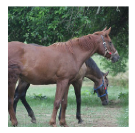
Figure 4: Image of a horse from the MS-COCO dataset, downsampled to 128x128

Figure 4 illustrates one such image from the MS-COCO dataset<sup>2</sup>.