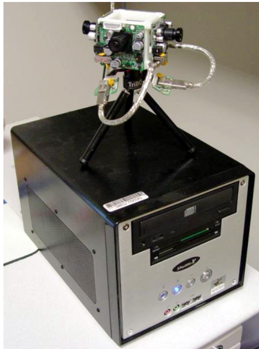
Fig. 3. CAMEO panoramic video capture device.

As part of the meeting recording architecture, CAMEO generates panoramic images in real time and streams them to an MPEG-4 movie file that can be used for off-line processing. While CAMEO can process video data directly from its cameras, it can load and process these movies off-line which allows the state information to be extracted and used as part of the larger meeting understanding problem.