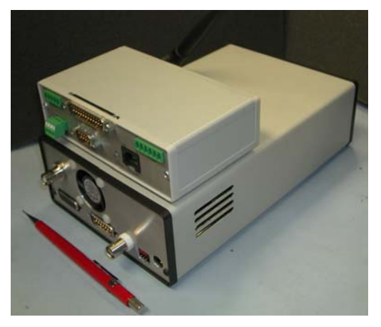
Figure 3: Electronics module

Electronics module : Figure 3 shows the electronics module consisting of the communications controller, data acquisition hardware and power supplies. These electronics allow the user to program the sensor, perform calibration, set up methods, alarms etc. using wired and wireless communication.