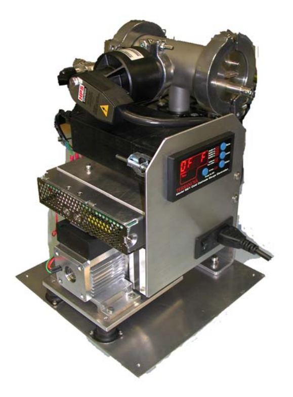
Figure 4: Integrated Vacuum System

Vacuum system : Figure 4 shows an integrated system and is based on the product concept shown in figure 1. This 10"x10"x14", 20 lb system consists of a turbo molecular pump, a diaphragm pump, a small vacuum chamber for the sensor and power supply for the pumps. The oil free pumps allow the unit to function in any orientation. The control electronics for the sensor can also be embedded into this system to make it a completely portable gas sensing unit.