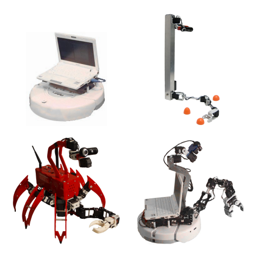
Fig. 1. The "flagship" Tekkotsu platforms, clockwise from upper left: Create/ASUS, Hand-Eye, Calliope, and Chiara hexapod

Tekkotsu originated on the Sony Aibo [3], a four-legged platform with moderate computational resources. Legged platforms emphasize the importance of real-time perfor-