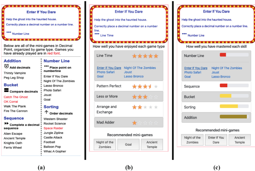
Fig. 2. The dashboards shown along the game map in the Control (a), Enjoyment (b) and Learning (c) condition. The skills in the Enjoyment condition are renamed to appear more playful, e.g., Addition becomes Mad Adder .

students were removed from our analyses due to not finishing all the materials. Using the outlier criteria from a prior study in Decimal Point [36], we excluded two students whose gain scores from pretest to posttest were 2.5 standard deviations away from the mean. Thus, our final sample included 159 students (82 males, 77 females). Each student was randomly assigned to one of three conditions: Control (CC), Enjoyment (EC) or Learning (LC). In each condition, students could (1) select the mini-games to play in any order, and (2) choose to stop playing any time after completing at least 24 rounds. Additionally, each condition features a different dashboard attached to the main game map shown in Fig. 1. After finishing each mini-game, students were taken back to the main map, where they could see the updated dashboard and make their next mini-game selection.