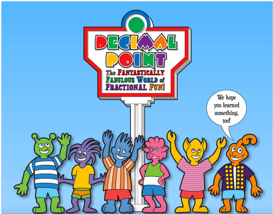
Figure 2. The end of Decimal Point