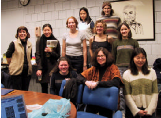
Undergrad Women@SCS Advisory Council and friends.