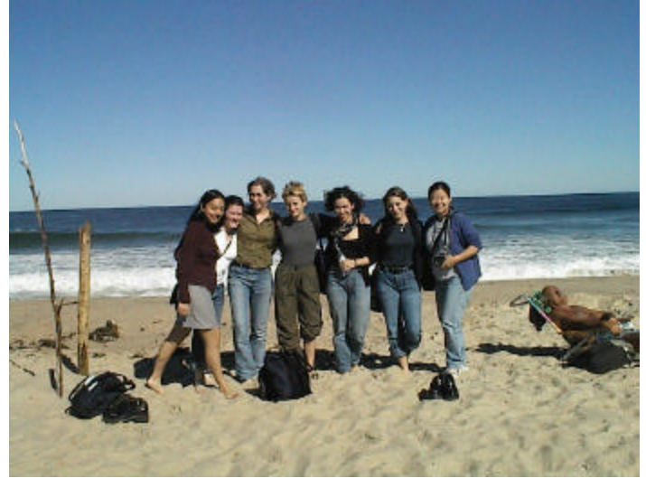
Time out at the Grace Hopper Celebration of Women in Computing, Cape Cod, September 2000.