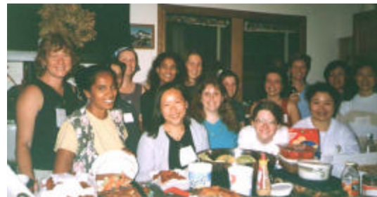
Graduate Student Potluck (above) and Picnic (below).