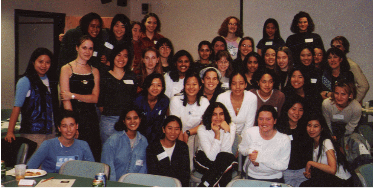
Big Sister/Little Sister get-together