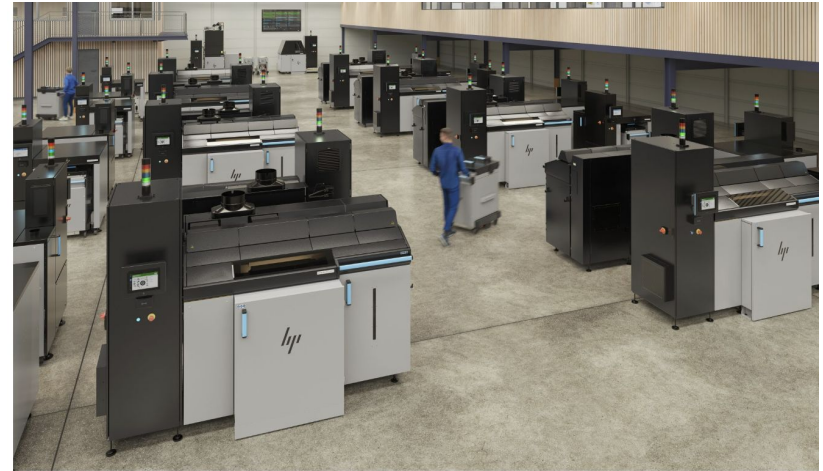
A fleet of metal 3D printers on production floor – HP Metal Jet S100.