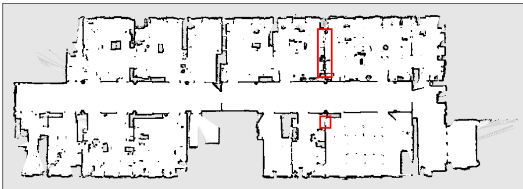
Figure 3: A map produced using an occupancy mapping technique. Regions in red indicate glass walls which are indicated as being either fully occupied or non-occupied.

and we use this as the value in the density grid. A comparison between occupancy mapping and density mapping highlighting this difference can be seen in Figures 3 and 4.