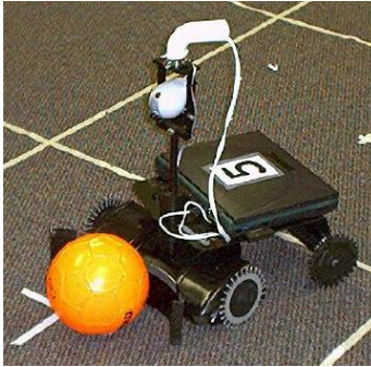
Fig. 1. Minnow robot platform.

drive unit includes a microcontroller which, in addition to controlling the motors, provides odometry and bump sensing. This microcontroller communicates with the host computer through an RS-232 connection.